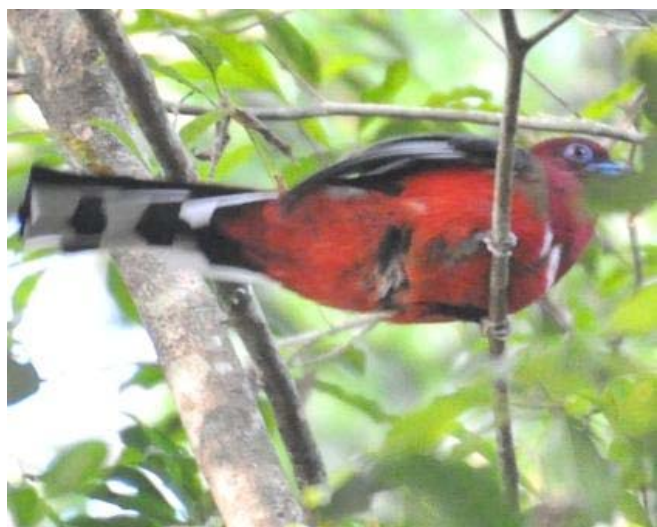
"Hainan" Red-headed Trogon

Harpactes erythrocephalus hainanus - Hainan endemic subspecies