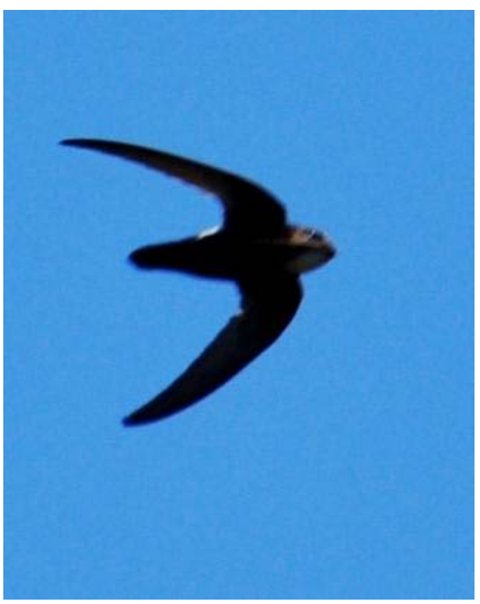
House Swift Apus nipalensis nipalensis

A few, seen each day in the mountains and also at Tianya Haijiao on Day 3, flying low over the palm trees.