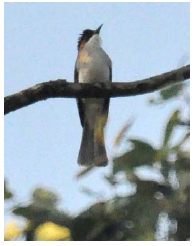
Chestnut Bulbul Hemixos castanonotus castanonotus

A few birds seen each day in and around the Ming Feng Valley.