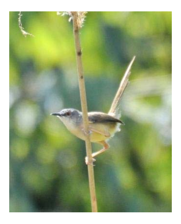
Hainan Leaf Warbler Phylloscopus hainanus – Hainan endemic

A few birds seen on the walk down from the Ming Feng Valley forest lodge to Tian Chi on Day 1 and Day 2.