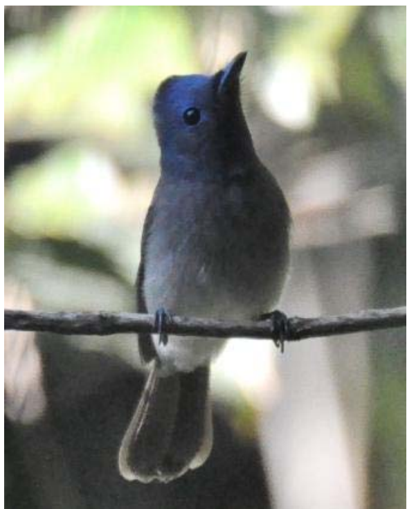
"Styan's" Black-naped Monarch Hypothymis azurea styani

One, a female, on Day 2, 400m from the start of the Primary Forest walk, on the return leg.