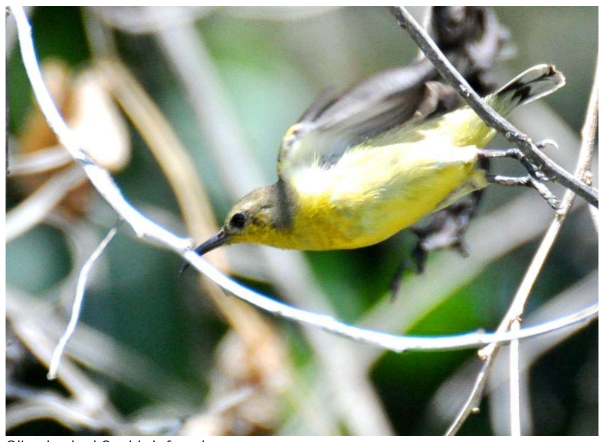
Olive-backed Sunbird, female

Wednesday, 25th – Friday, 27th February 2009