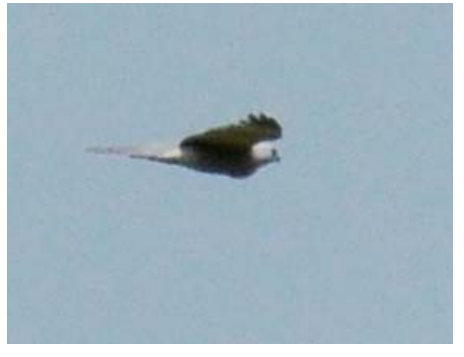
Chinese Goshawk Accipiter soloensis