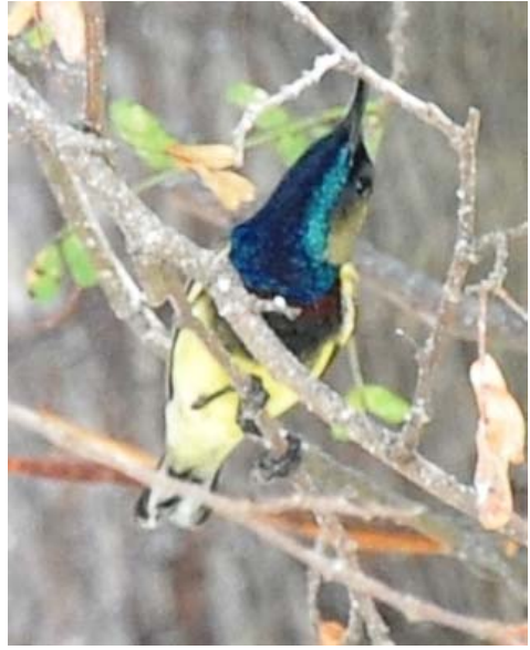
"Christina's" Fork-tailed Sunbird

Aethopyga christinae christinae – Hainan endemic nominate subspecies