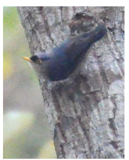
"Hainan" Yellow-billed Nuthatch Sitta solangiae chienfengensis - Hainan endemic subspecies